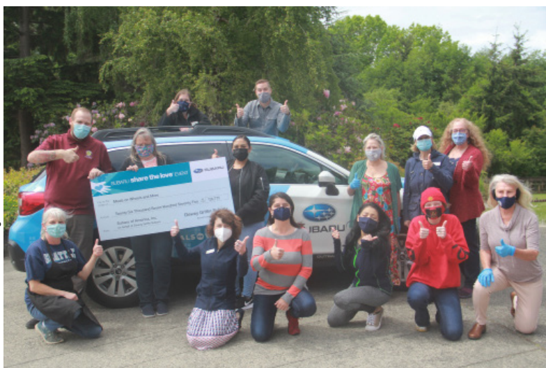
WCOA Staff and Volunteers Celebrate the 2020 Subaru Share the Love Event Donation from Subaru of America and Dewey Griffin Subaru

Meals on Wheels and More is thrilled to once again be Dewey Griffin Subaru's Hometown Charity for the 2021 Subaru Share the Love Event. For each new Subaru purchased or leased at Dewey Griffin Subaru between November 18 th , 2021 and January 3 rd , 2022, Subaru of America will donate $250 to the customer's choice of four national charities, including Meals on Wheels America, or to the Whatcom Council on Aging's Meals on Wheels and More program. Over the past nine years Meals on Wheels and More has received nearly $250,000 in Subaru Share the Love Event related funding from a combination of donations from Subaru of America and Dewey Griffin Subaru and grants from Meals on Wheels America. Yes, you read that right, a quarter of a million dollars!!!